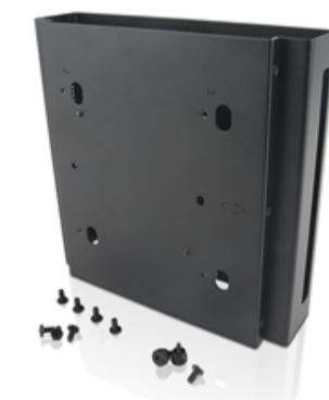
ThinkCentre Tiny Sandwich Kit II