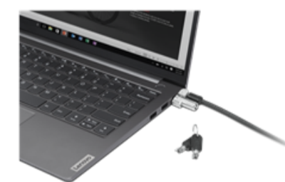
NanoSaver Cable Lock from Lenovo