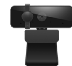
Lenovo Essential FHD Webcam Gen2