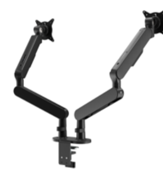
Hexergo Dual Monitor Arm Black CTS203