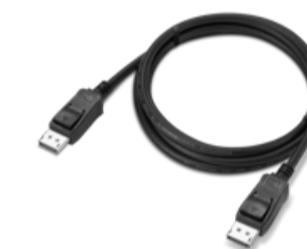
Lenovo DisplayPort to DisplayPort 1.4 cable 1.8m