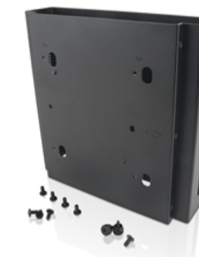
ThinkCentre Tiny Sandwich Kit II