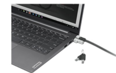
NanoSaver Cable Lock from Lenovo