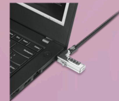
Combination Cable Lock from Lenovo 4XE1F30278