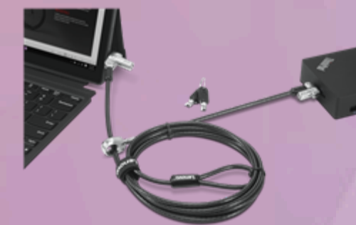
NanoSaver Twin Head Nano/MS 2.0 MasterKey Cable Lock from Lenovo 4XE1B81920

Please click here to view the full list of accessories.