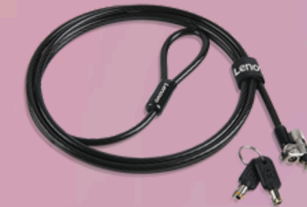
Kensington MicroSaver DS 2.0 Cable Lock from Lenovo 4XE1L68273