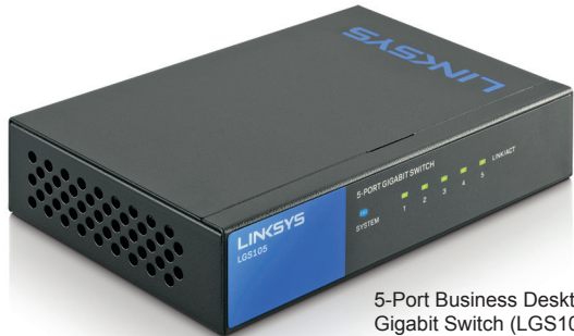
5-Port Business Desktop Gigabit Switch (LGS105)