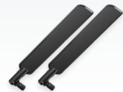
HGO indoor antenna kit