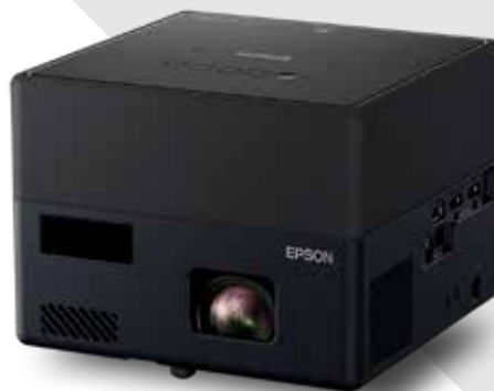
EpiqVision Mini EF-12 Android TV™ device

Access 400,000+* movies and shows, cast photos, listen to music, and more 1 .