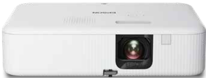
CO-FH02 | Android TV™ device