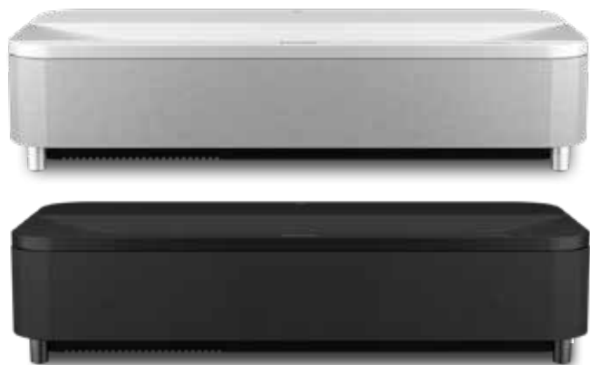
EpiqVision Ultra EH-LS800W | Android TV™ device EH-LS800B | Android TV™ device