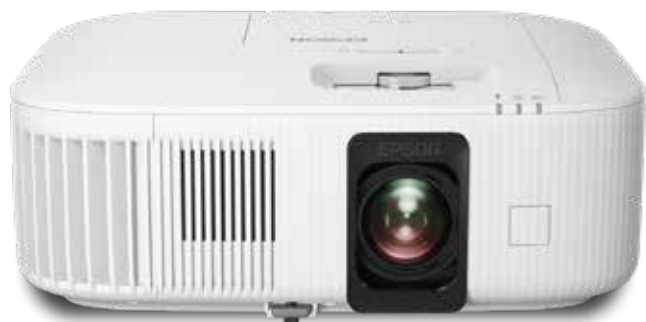
EH-TW6250 | Android TV™ device