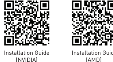
Installation Guide (NVIDIA) Installation Guide (AMD)