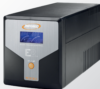
E2 LCD 1000