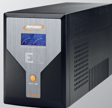
E2 LCD 1500 & 2000