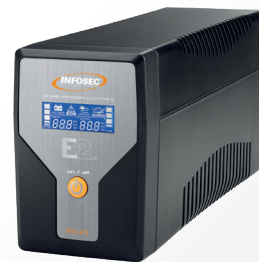
E2 LCD 600 & 800