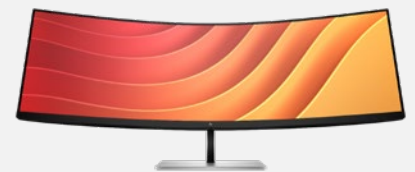
HP E45c G5 DQHD Curved Monitor