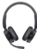
Dell Pro Wireless Headset - WL5022

Get immersive productivity on a 34" WQHD curved monitor with a wide color coverage and extensive connectivity including RJ45, USB-C and quick-access front ports.