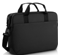
Dell EcoLoop Pro Briefcase - CC5623

Modular Thunderbolt 4 dock with swappable modules for easy upgrades and SuperBoost technologies for fast charging.