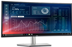
UltraSharp 34 Curved Monitor USB-C Hub - U3423WE

Get immersive productivity on a 34" WQHD curved monitor with a wide color coverage and extensive connectivity including RJ45, USB-C and quick-access front ports.