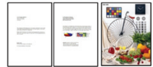
#1 Black Text #2 Colour #3 Photo 4R

*1 Print speed (Pages Per Minute) is calculated when printed on A4 plain paper in the fastest mode, 10 x 15 cm photo print speed when printed on Epson Premium Glossy Photo Paper. Print speed may vary depending on system configuration, print mode, document complexity, software, type of paper used and connectivity. Print speed does not include processing time on host computer.