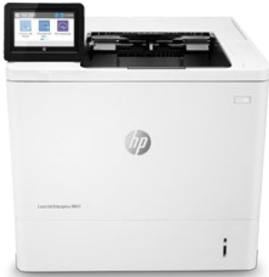
HP LaserJet Enterprise M611dn

This HP LaserJet Printer with JetIntelligence combines exceptional performance and energy efficiency with professional-quality documents right when you need them—all while protecting your network from attacks with the industry's deepest security. 1