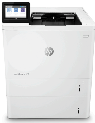
HP LaserJet Enterprise M611x