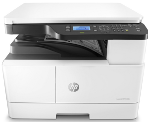
HP LaserJet MFP M438n

Surpass your office printer expectations with the speed, quality, and efficiency of HP LaserJet office printers.