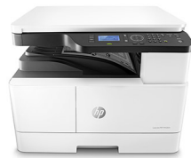
HP LaserJet MFP M438n