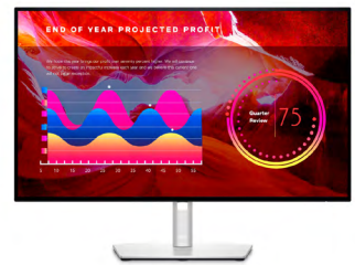
Dell UltraSharp 27 Monitor - U2722D

World's slimmest and lightest soundbar offers exceptional audio clarity and easy magnetic attachment to your Dell monitors, ensuring a clutter-free desk.