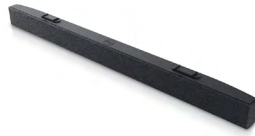
Dell Slim Soundbar - SB521A

An immersive 34" WQHD curved monitor with wide color coverage and extensive connectivity including RJ45, USB-C® and quick-access front ports.