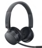
Dell Pro Wireless Headset - WL5022

Elevate your video conferencing experience with this high quality 4K webcam that optimizes your visuals with a large 4K Sony STARVIS™ CMOS sensor and AI Auto-Framing.