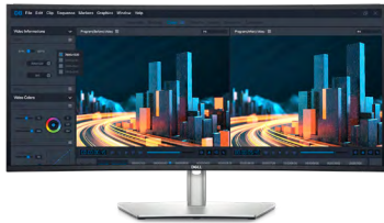
Dell UltraSharp 34 Curved USB-C HUB Monitor - U3421WE

An immersive 34" WQHD curved monitor with wide color coverage and extensive connectivity including RJ45, USB-C® and quick-access front ports.