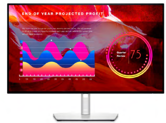
Dell UltraSharp 27 Monitor - U2722D

World's slimmest and lightest soundbar offers exceptional audio clarity and easy magnetic attachment to your Dell monitors, ensuring a clutter-free desk.