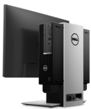
OptiPlex Small Form Factor All-in-One Stand - OSS21

Create a clean workspace for your Small Form Factor with integrated cable management and full range monitor adjustability.