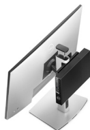
OptiPlex Micro All-in-One Stand - MFS22

Create a clean workspace for your Small Form Factor with integrated cable management and full range monitor adjustability.