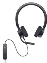
Dell Pro Stereo Headset - WH3022

Enhance your everyday productivity with a quiet full size keyboard and mouse combo that offers programmable shortcuts and 36 months battery life. 18