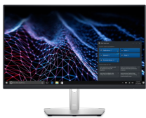
Dell UltraSharp 24 Monitor - U2422H

Elevate your productivity on this 24" FHD monitor with brilliant color coverage and ComfortView Plus, an always on built-in low blue light screen.