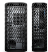
OptiPlex Tower, Small Form Factor Cable Covers

Experience crystal-clear conference-calls with the world's most intelligent Microsoft Teams-certified speakerphone. 19