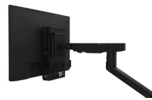
OptiPlex Micro Dual VESA Mount with Adapter Bracket

Adjustable, compact stand for your micro creates a clean, open workspace with minimal cables.