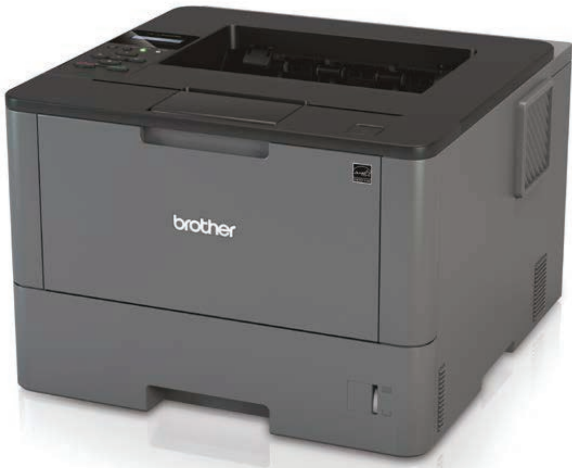
HL-L5200DW Black & White Laser Printer