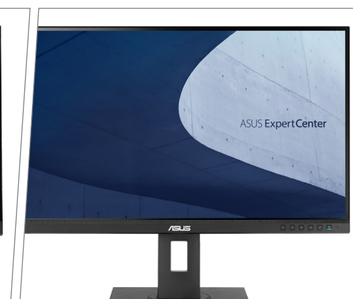
ASUS BE279CLB Business Monitor