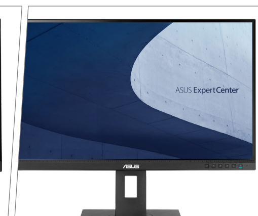
ASUS BE279CLB Business Monitor