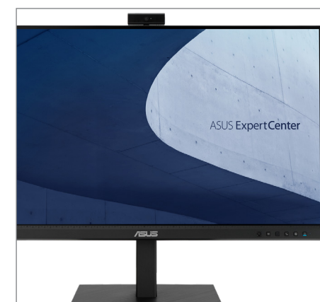
ASUS BE279QSK Video Conferencing Monitor